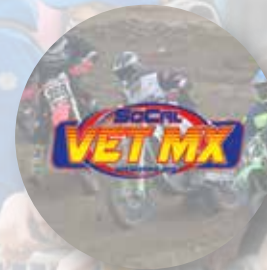
SO CAL OLD TIMERS VET MX