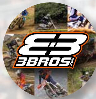
6, 10, & 24 HOUR ENDURANCE RACE