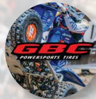
UTV/QUAD/TROPHY KART SERIES