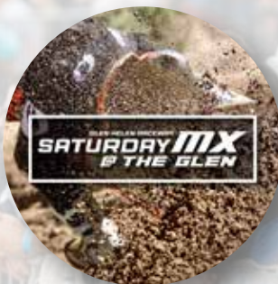
SATURDAY MX @ THE GLEN SERIES