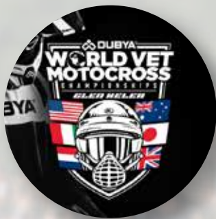
WORLD VET MX CHAMPIONSHIPS