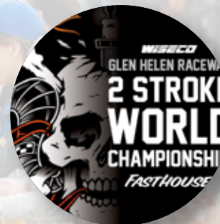
2-STROKE MX CHAMPIONSHIPS