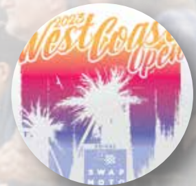
SWAP MOTO MX SERIES