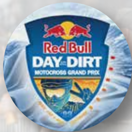
DAY IN THE DIRT