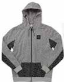
STATIC ZIP-UP $59.95