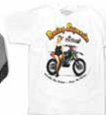
LADY TEE $26.95