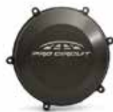
CLUTCH COVERS FROM $169.95