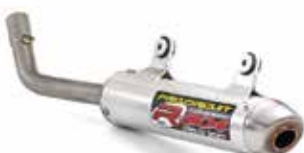
R-304 STAINLESS SILENCER $141.71