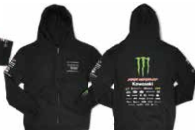
2019 FULL LOGO ZIP-UP $49.95