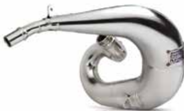
PLATINUM PIPE FROM $242.96