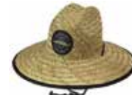
STRAW HAT $20.95