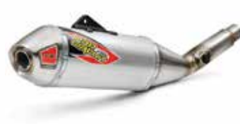
T-6 STAINLESS STEEL SLIP-ON FROM $488.21

PERFORMANCE EXHAUST SYSTEMS AVAILABLE FOR ALL MAJOR BIKE BRANDS INCLUDING: HONDA • HUSQVARNA • KAWASAKI • KTM • SUZUKI • YAMAHA