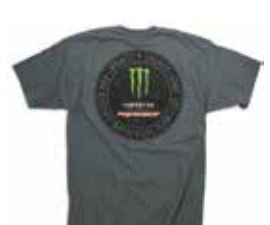
PATCH TEE $24.95