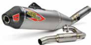
TI-6 TITANIUM EXHAUST SYSTEM FROM $1,049.96