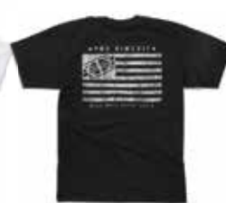
FLAG TEE $22.95