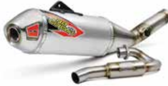
T-6 STAINLESS STEEL EXHAUST SYSTEM FROM $818.96