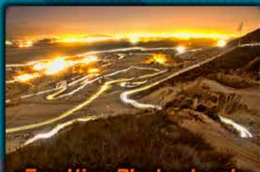
-For Hire Photoshoots