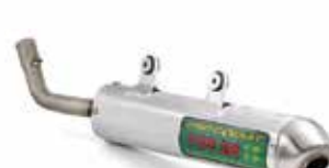
TYPE 296 SPARK ARRESTOR SILENCER $167.96