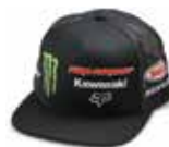
'19 PODIUM SNAPBACK $37.95