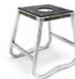
BIKE STAND $145.00