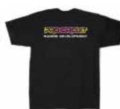
RACING DEVELOPMENT TEE $28.95