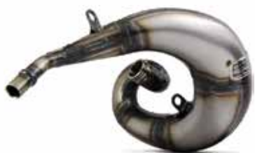
WORKS PIPE FROM $242.96

EXHAUST • ENGINE • SUSPENSION • ACCESSORIES • APPAREL