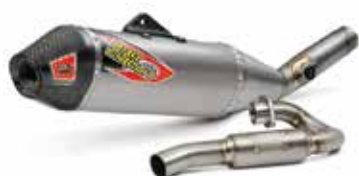
TI-6 PRO TITANIUM EXHAUST SYSTEM FROM $1,049.96