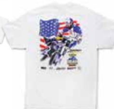
PEAK/HONDA TEE $27.95