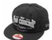
OUTFITTERS HAT $29.95