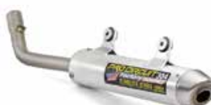
304 FACTORY SOUND SILENCER $141.71