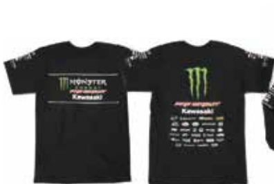
2019 FULL LOGO TEE $24.95