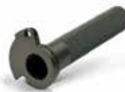
THROTTLE TUBES FROM $59.95