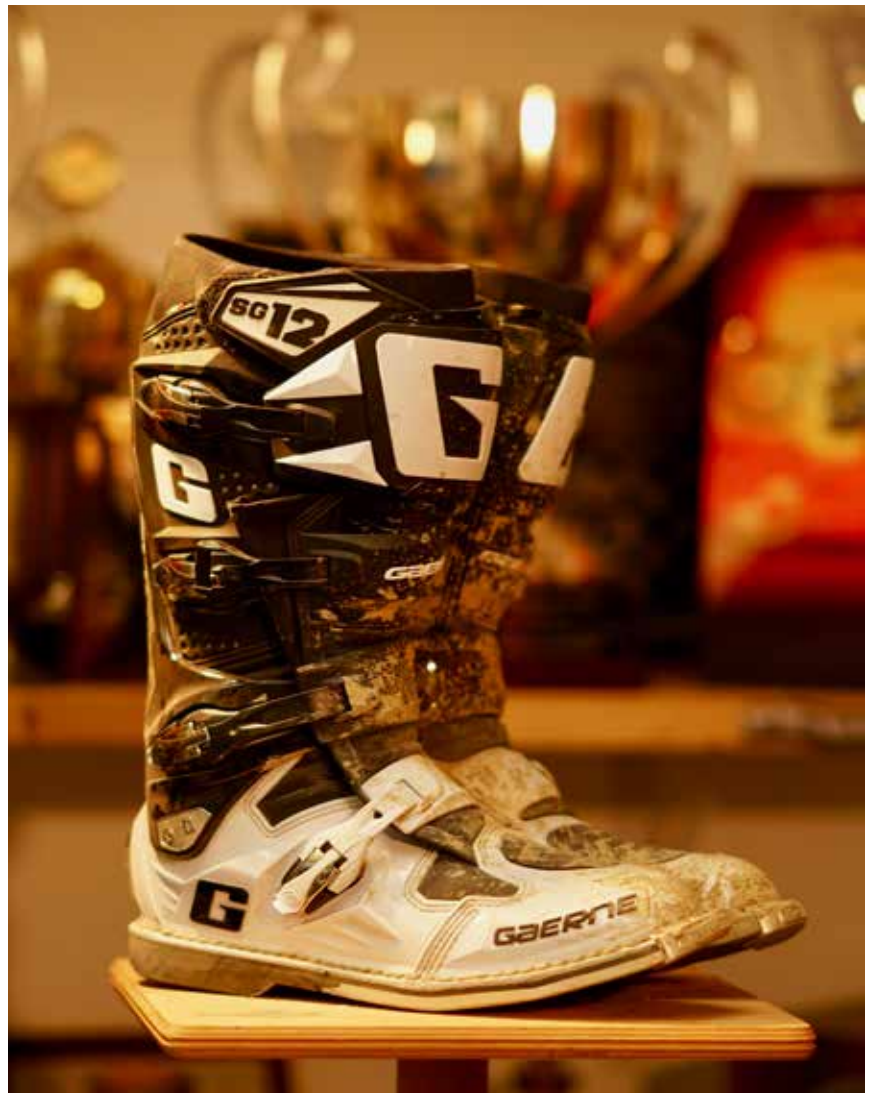
Modern motocross bikes are fast, and furious and our feet take an amazing amount of abuse. Fortunately for motocross, incredible companies like Gaerne design and manufacture phenomenal foot and ankle technologies that allow us to hit and absorb corners, jumps and ruts with confidence and security.

Whether we find ourselves injured and unable to ride, or not quite fit and fast as we could be, or used to be.. or we are on top of the world with wins and championships, the blood of our commonality flows in the same direction. With passion and a zest for life.