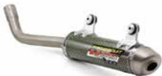
TI-2 SILENCER $329.95