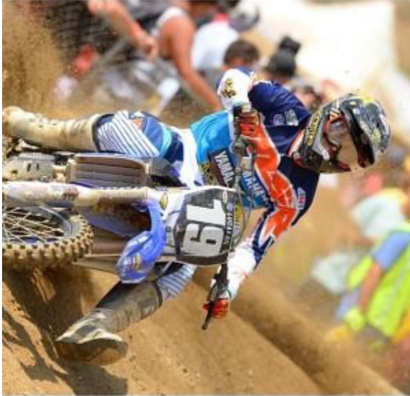
Jeremy Martin.