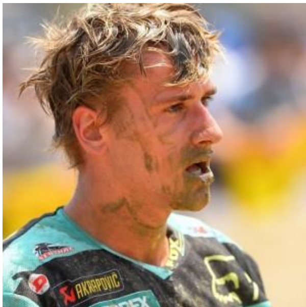
Ken Roczen.