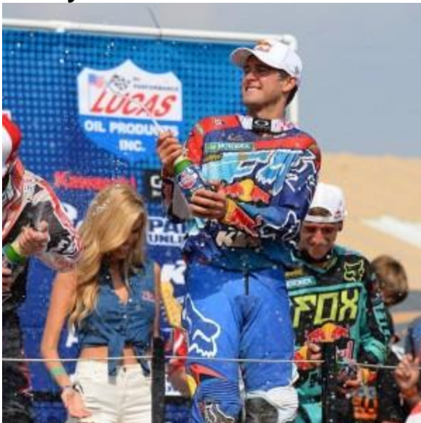
Ryan Dungey.